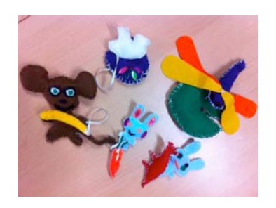
Figure 1: Figure projects included a swan on a lake, a dragonfly and a monkey with a banana.