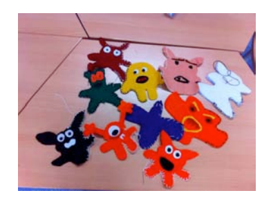
Figure 3. Some of the children's monsters.

our example project this was a stuffed rabbit containing the board with a carrot housing the magnet (see Figure 1). When the carrot was touched to the rabbit's mouth, its belly lit up to show it was happy. Some children elected to create alternate forms.